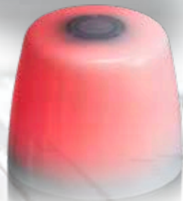
Mono-color Model (Red)